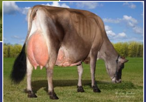
Oakfield Tbone Vivianne