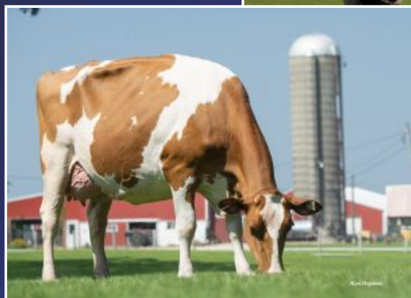
Luck E Mcgucci Afro Red