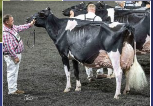
MS Beautys Black Velvet