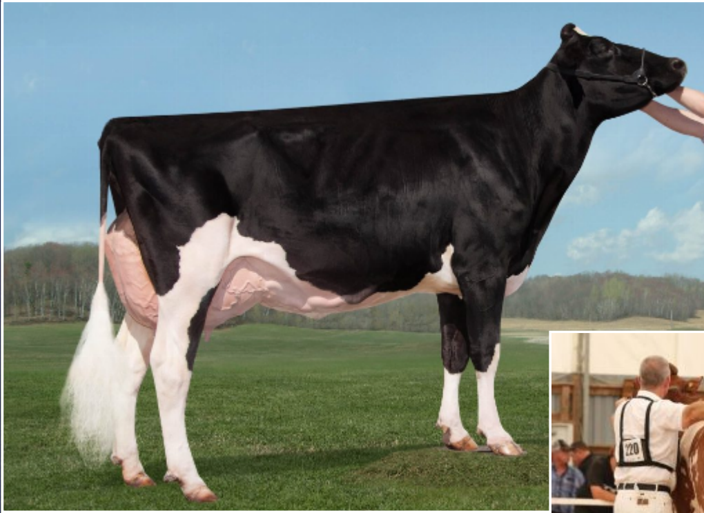
MS Apples Aria RC