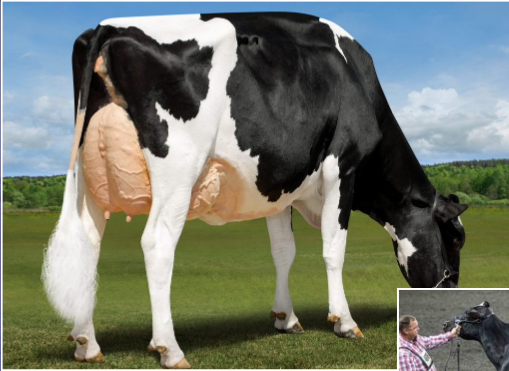
Duckett Doorman Victory