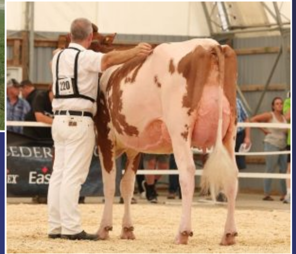
Golden Oaks Alexis Red 2y VG-87 CAN